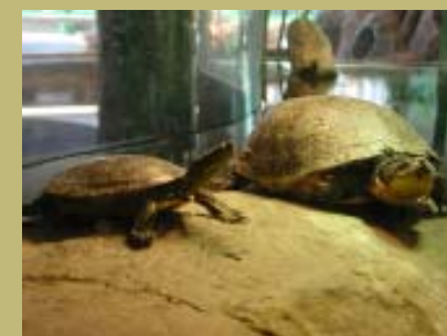
Live Animal Habitats