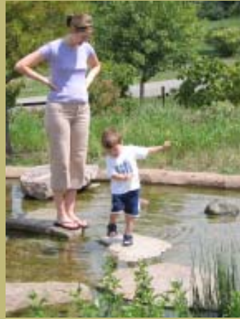
Woodland Play Stream