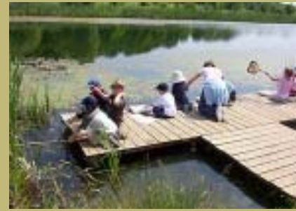
Teal Pond Boardwalk